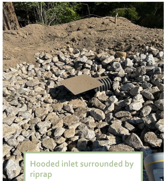
Hooded inlet surrounded by riprap

Typically supplied by quarries, riprap has angled edges that lock together and help to hold the stone in place.